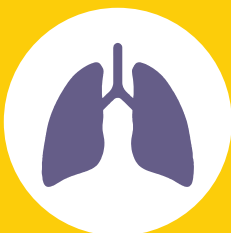
Rapid, shallow breathing