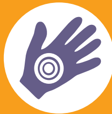
Warm, flushed skin